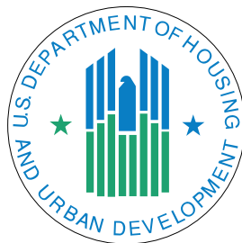
Housing Trust Fund