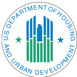
HOME Investment Partnerships