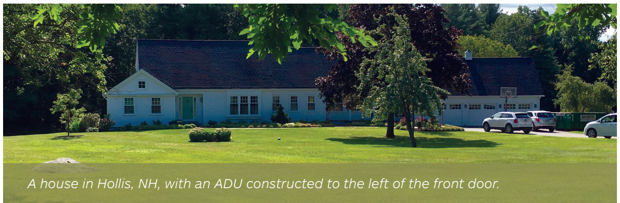
A house in Hollis, NH, with an ADU constructed to the left of the front door.