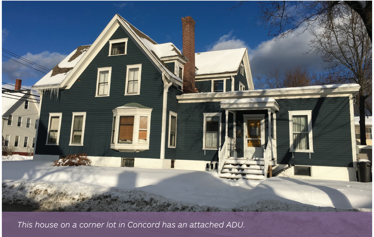
This house on a corner lot in Concord has an attached ADU.