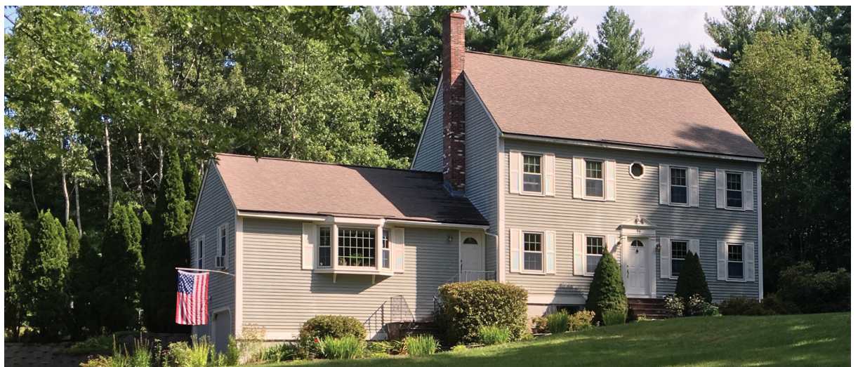
An ADU is seen attached to the left side of this home in Hollis, NH.